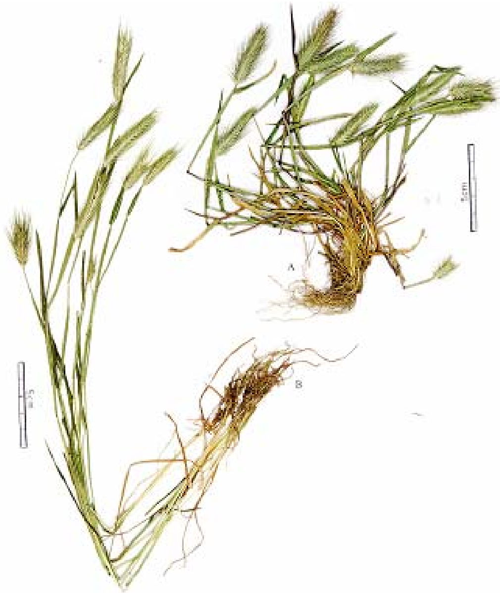
Fig. 1. Habit of Hordeum marinum Huds. A: ssp. marinum (Isfahan, Zayand-e Rud river banks) B: ssp. gussoneanum (Parl.) Thell. (Shiraz, Passargad)

adaxial side sparsely hairy, 5-nerved; palea awnless, abaxial side glabrous or with short cilia on the keels, adaxial side sparsely hairy, 2-nerved; lodicules entire and glabrous (Figs. 1-3).